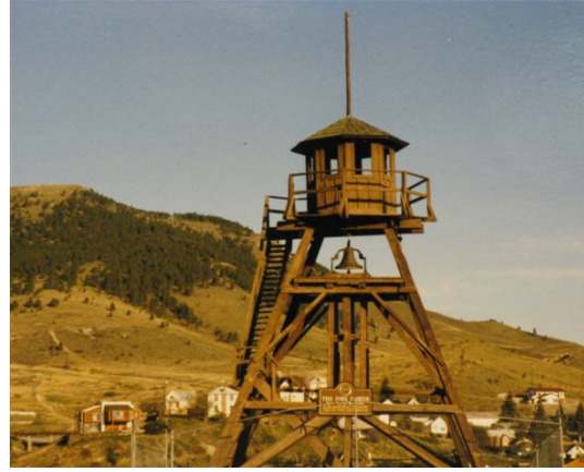
Helena, MT fire tower 2009

The Southern Pacific Railroad established a fire lookout on Red Mountain to protect their snow sheds in the northern California Sierras in 1878.