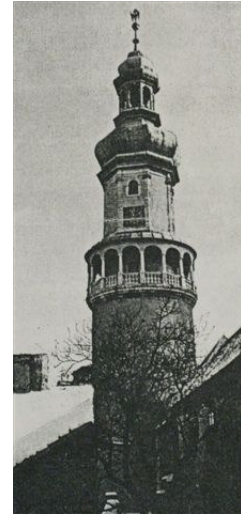
Sopron, Hungary Fire Tower 1681-1955

The oldest lookout still standing that we've been able to trace, is the Tuztoromy Firewatch Tower in the city of Sopron, Hungary. Built early in the 13th Century, remodeled in 1681, it remains this famous resort city's major attraction... 700 years later!