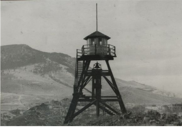
Helena, MT fire tower since 1869